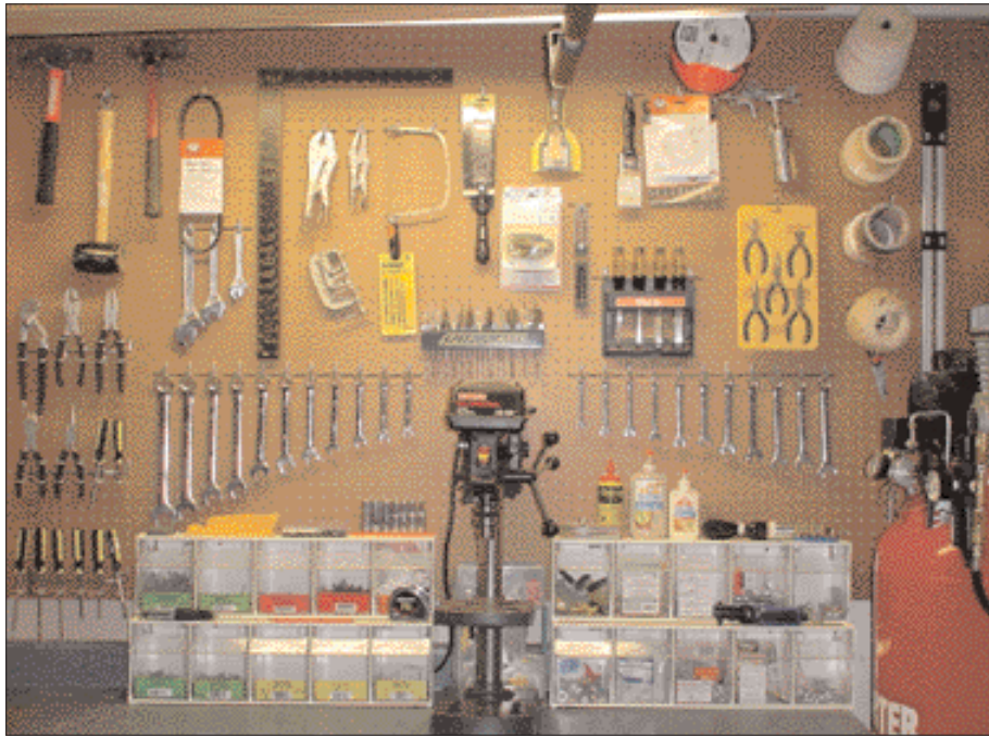
Making use of a garage's vertical space can clear the way for those vehicles looking for a home. System designed by Control the Clutter.

Making the most of your home's storage space